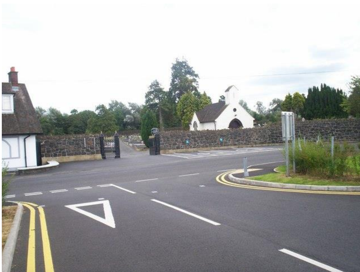
Entrance to Lurgan Cemetery