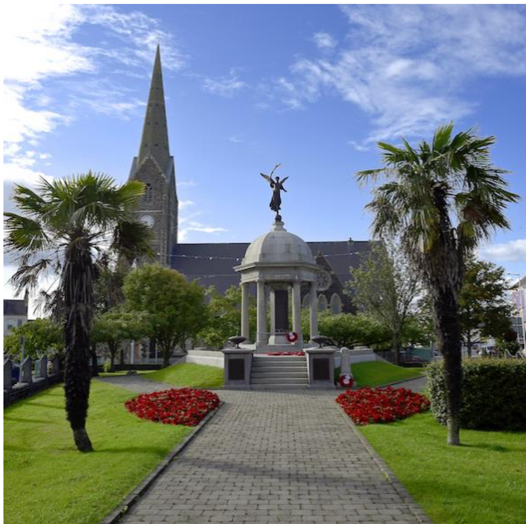
Lurgan War Memorial