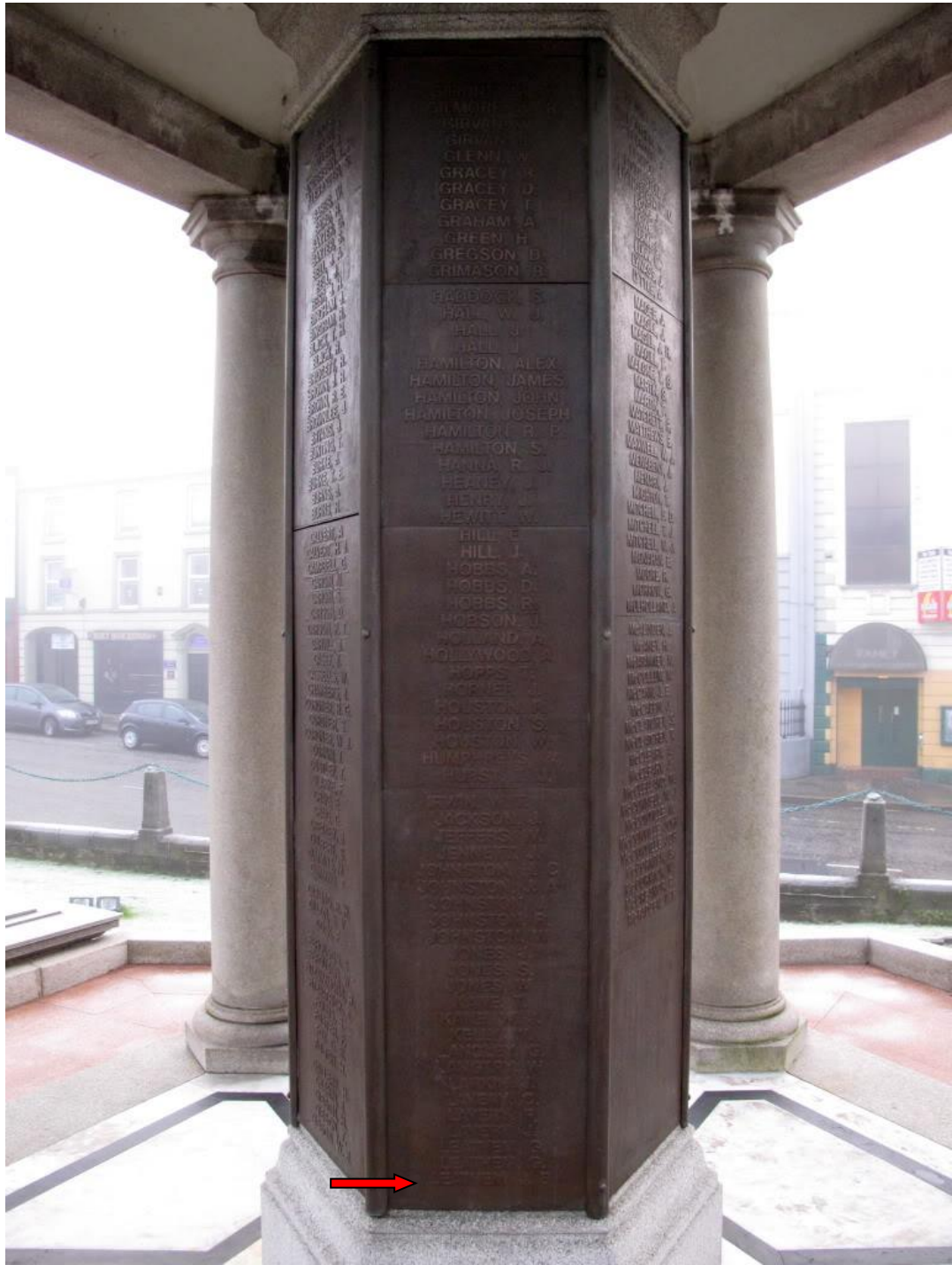
Last name on Panel 3 of Lurgan War Memorial